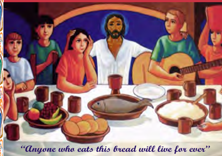
"Anyone who eats this bread will live for ever"

Grant, O Lord, we pray, that we may delight for all eternity in that share in your divine life, which is foreshadowed in the present age by our reception of your precious Body and Blood. Who live and reign for ever and ever.