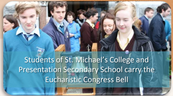
Students of St. Michael's College and Presentation Secondary School carry the Eucharistic Congress Bell