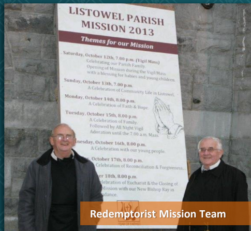
Redemptorist Mission Team

The Diocesan Levies go towards the administration costs of the Diocese and are used solely for this purpose. The Parish Finance Council expresses sincere thanks to you for your financial support. Your generosity is much appreciated and makes it possible to run the parish and undertake these structural activities when necessary.