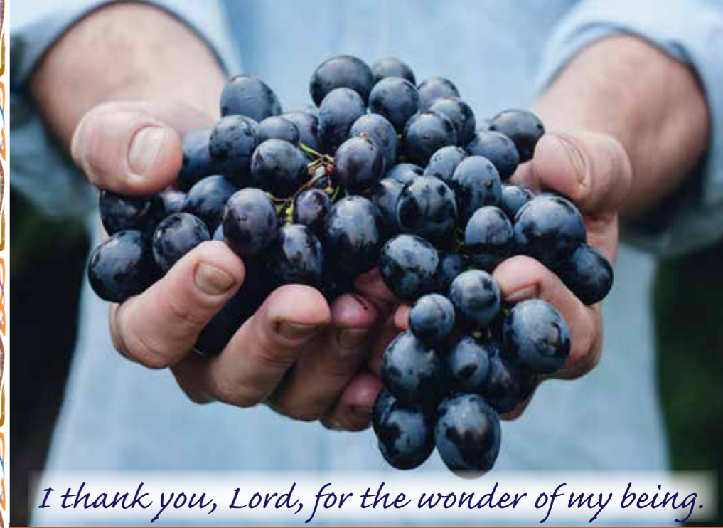
I thank you, Lord, for the wonder of my being.

The graces and gifts which God gives to us are both signs to us of his love and his care, and also his expectation that they will bear fruit in our lives.